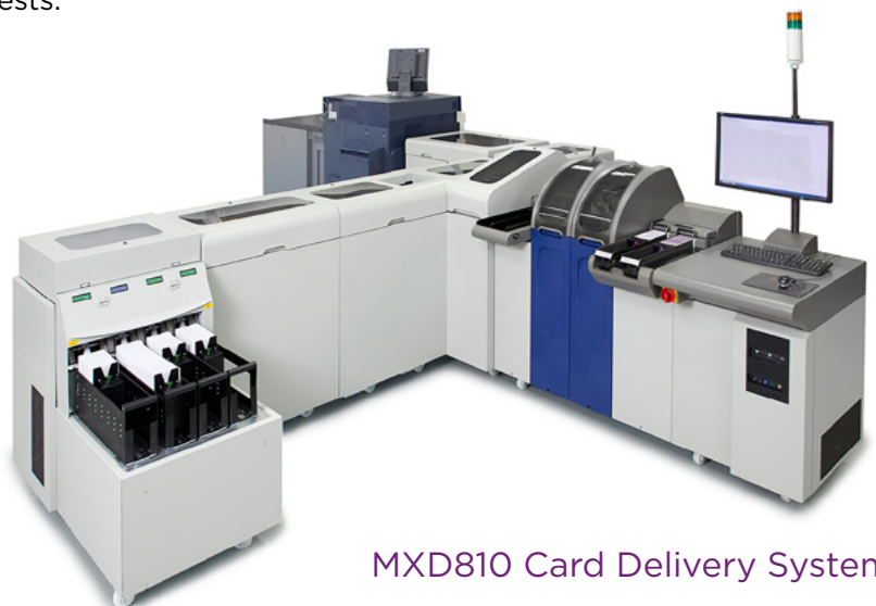
MXD810 Card Delivery System

Support market trends: Meet the growing vertical card trend without limiting job sizes based on card orientation. Dynamically place cards on carriers horizontally and vertically to meet customer requests.