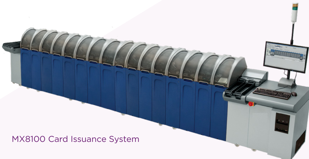
MX8100 Card Issuance System

Service and support: The MX Series Platform is supported by the industry's largest service and support network, which spans more than 150 countries worldwide. Online and phone support is available 24/7.