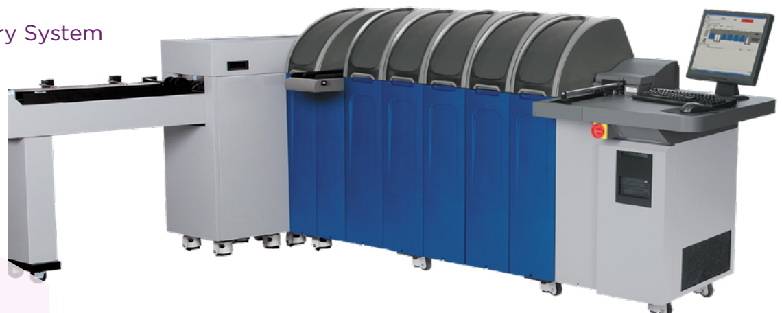
MXD210 Card Delivery System

Print-on-demand: Leverage black and white printing inline, feeding pre-printed sheets into the system.