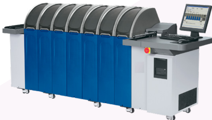
MX2100 Card Issuance System

Service and support: The MX Series Platform is supported by the industry's largest service and support network, which spans more than 150 countries worldwide. Online and phone support is available 24/7.